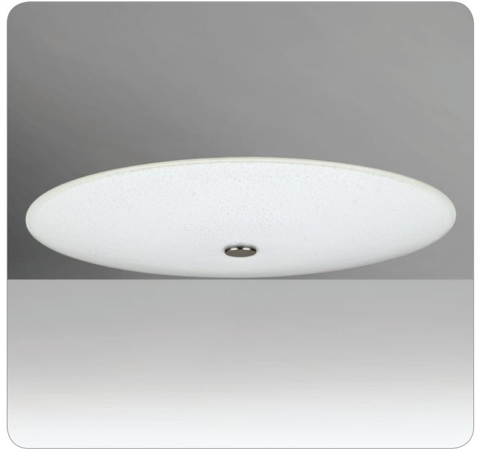
RENFRO CEILING SHOWN IN WHITE SPARKLE

UL or ETL Listed. Suitable for Damp Locations (interior use only).